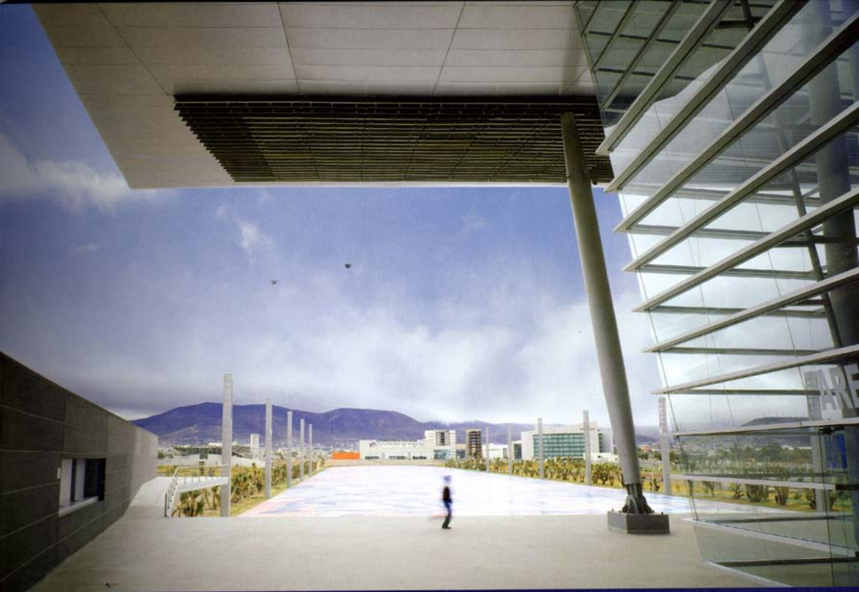
From left to right, from above to below: Principal façade detail, main façade, concert hall. Right: View to the mural plaza.