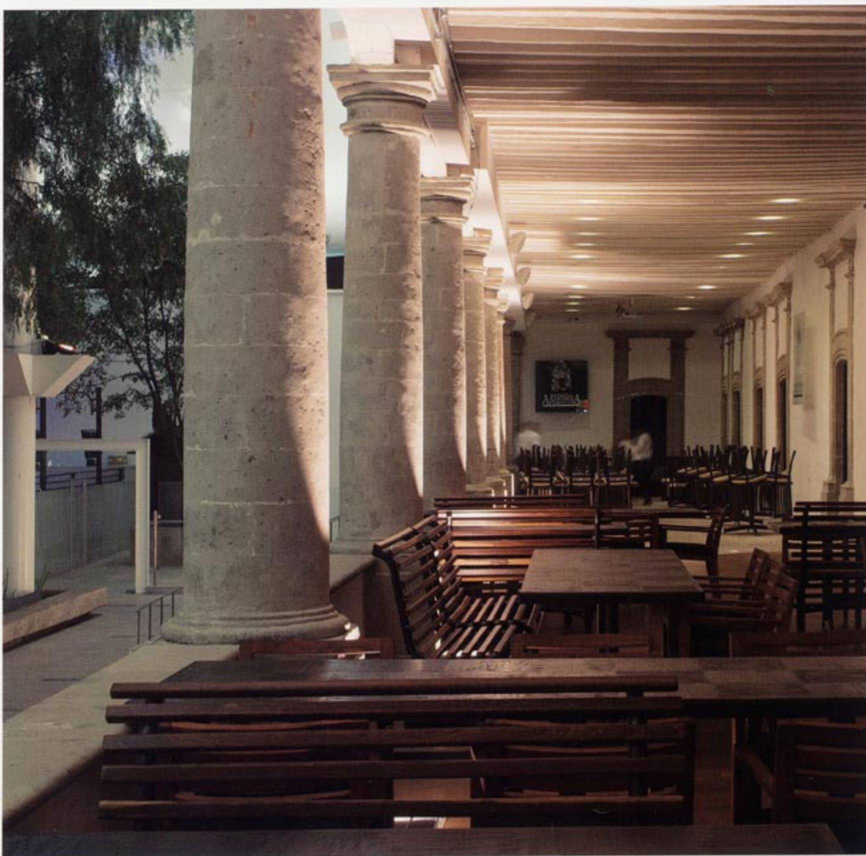
↑ | Exterior view, at night ← | Restored area, museum and dining