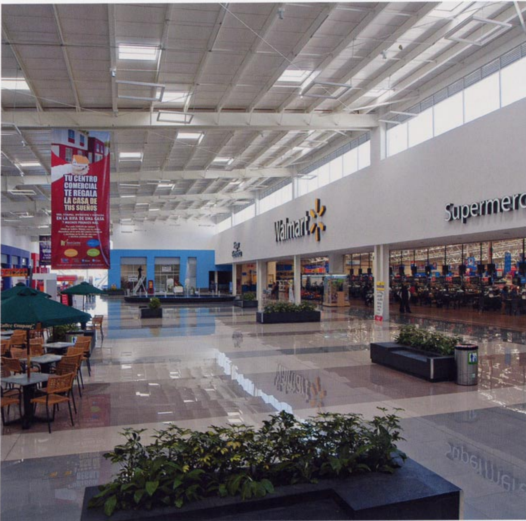
↑ | Open-air courtyard ← | Bright, reflective interior design